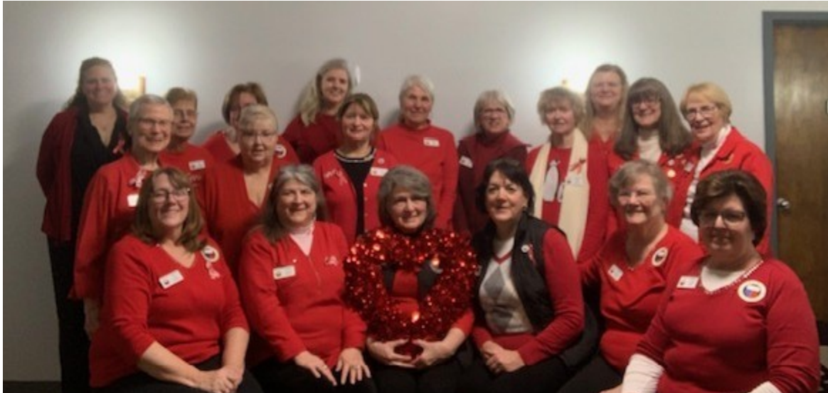
Club members attended the February club meeting wearing their red attire in recognition of Heart Health Month.